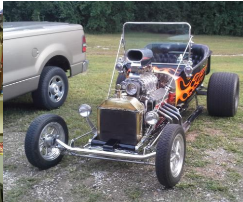
Bilbee, Larry - Joined 1967, Owns many cars- 1940 Ford 427, 1916 Bucket T w/ Blown 427, 1956 Custom Ford Pickup + More.